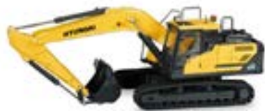
Hyundai HX220 Model