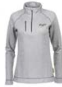
Ponsse Women's Half Zip (Part #: 1383size)