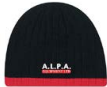
A.L.P.A. Beanie (Part #: Beanie-ALPA-Red)