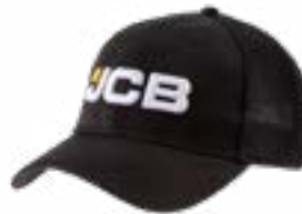
JCB Mesh Cap - 3D text (Part #: JCB2048)