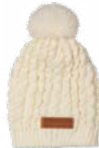
Women's Knitted Hat (Part #: 1308)