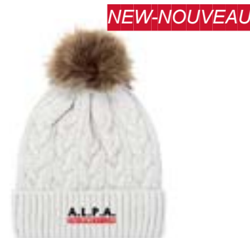
A.L.P.A. Cable Knit Tuque (Part #: Tuque-ALPA-White)