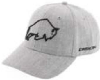
Ponsse Bison Cap (Part #: 1394cap)