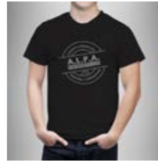
A.L.P.A. T-Shirt (Part #: ALPA T-Shirt-size)