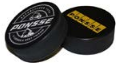
Ponsse Ice Hockey Puck (Part #: 938)