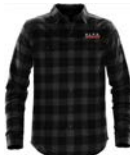
A.L.P.A. Charcoal Plaid Shirt (Part #: FLX-1MCHA-size)