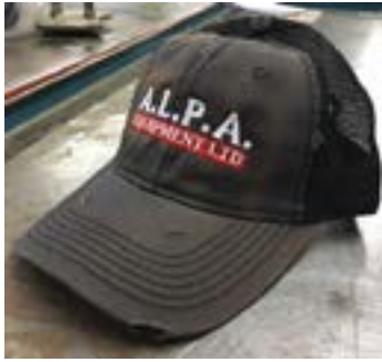
A.L.P.A. Mesh Cap (Part #: Cap-ALPA-SUM-BL)