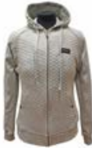
Ponsse Women Grey hoodie (Part #: 1235size)