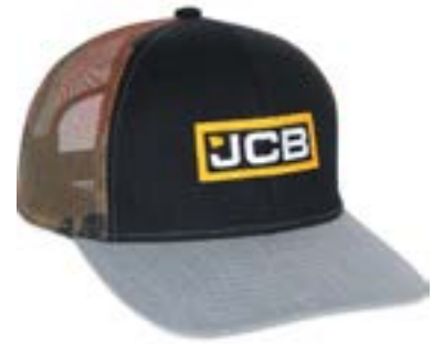
JCB Camo Hat (Part #: 31007)