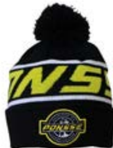
Hockey Beanie (Part #: 1290)