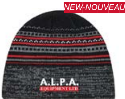
A.L.P.A. Beanie (Part #: Beanie-ALPA-Red)