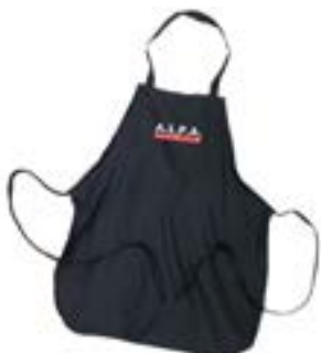
A.L.P.A. Apron (Part #: A3629)