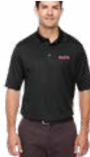
A.L.P.A. Men's Polo (Part #: ALPA-size-Polo)