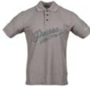
Ponsse Men's Grey Pique Shirt (Part #: 1310size)