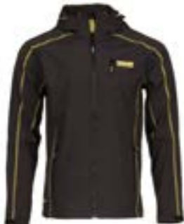
Ponsse Softshell (Part #: 1347size)