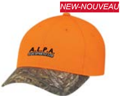
OREGON ALPA Hunting Hat (Part #:ALPA-CAP-ORANGE)