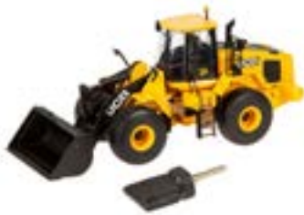
JCB 467 Wheel Loader (Part #: 98006)