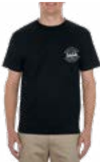
A.L.P.A. T-Shirt with Pocket (Part #: ALPA-T-Shirt-PKT.size)