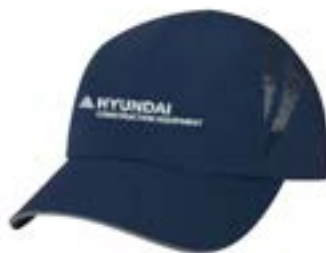
Hyundai Performance Cap