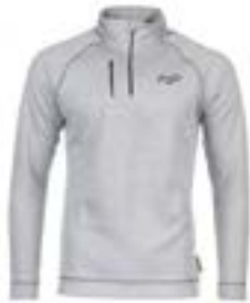
Ponsse Men's Half Zip (Part #: 1382size)