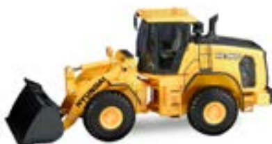
Hyundai HL960 Model