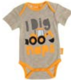
JCB Infant Body Suit (Part #: 83005 WH size)