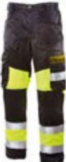
Ponsse Summer Safety Trouser (Part #: 908size)