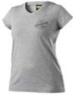
Ponsse Women's Grey T-Shirt (Part #: 1216)