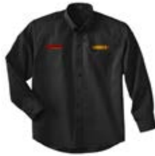
Landrich Men's Long Sleeve