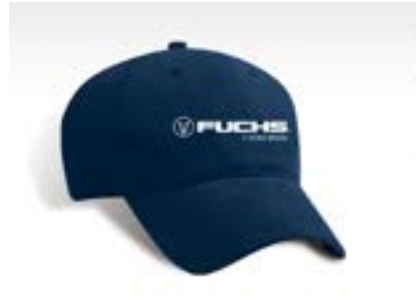
Fuchs Canvas Cap (Part #: FP352-FUCHS)