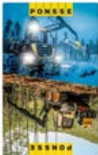
Ponsse Playing Cards (Part #: 1353)