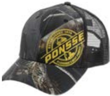
Ponsse Camp Cap (Part #: 1316)