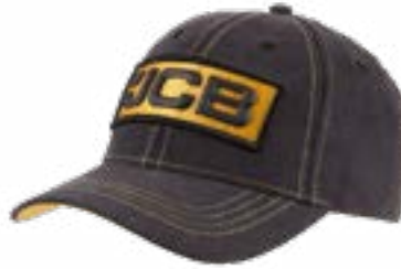
JCB 3D Cap (Part #: 31003 or JCB 1847)