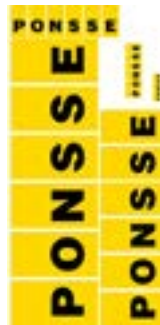
Ponsse Vehicleé Trailer Sticket Kit