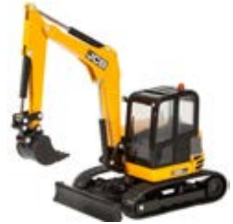
JCB 86C-1 Midi Excavator (Part #: 98008)