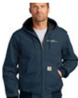
Hyundai Artic Hoodie