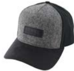
Woolen Cap (Part #: 1492)