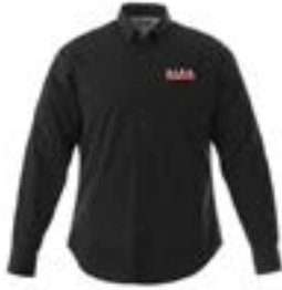
A.L.P.A. Men's Long Sleeve Shirt (Part #: shirt-size-LS)