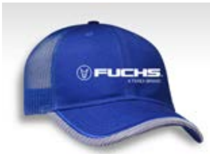
Fuchs Light Blue Cap (Part #: FP413-Fuchs)