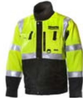
Hyundai Performance Shirt (Part #: 907size)