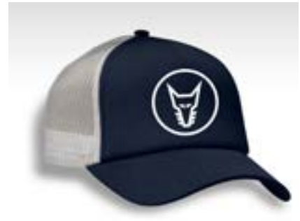
Fuchs Trucker Cap (Part #: FP144-Fuchs)