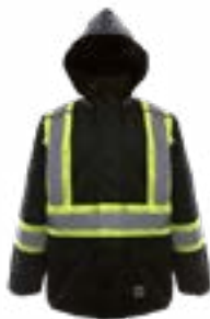
A.L.P.A. Rain Jacket (Part #: 6323JB.size)