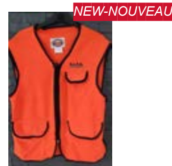
OREGON ALPA Hunting Vest (Part #: ALPA-VEST-ORANGE)