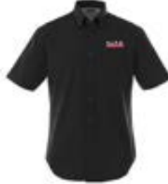
A.L.P.A. Men's Short Sleeve Shirt (Part #: shirt-size-SS)