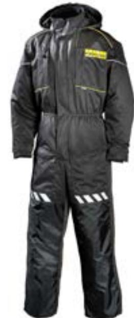
Ponsse Winter Coverall (Part #: 972size)