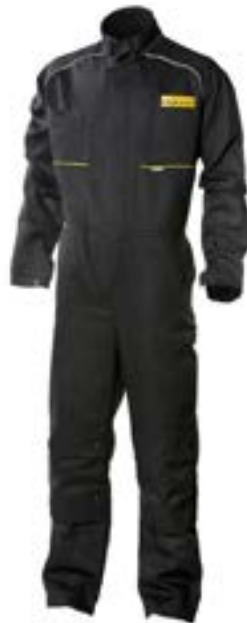
Ponsse Cotton Overall (Part #: 981size)