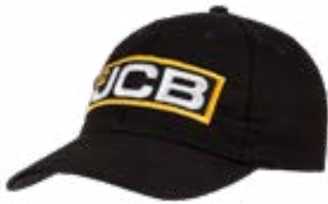
JCB Classic Cap (Part #: JCB13009)