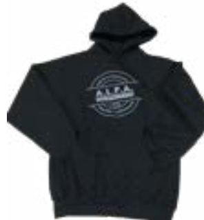
A.L.P.A. Hoodie (Part #: ALPA-Hoodie-size)