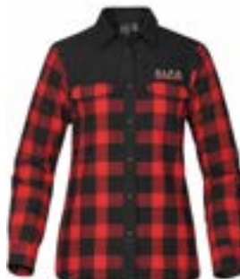
A.L.P.A. Women's Thermal Red (Part #: FLX-INSU-1WRED-size)