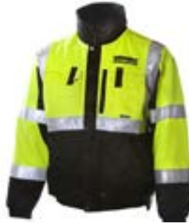
Ponsse Winter Safety Coat (Part #: 949size)