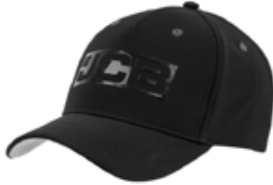
JCB Softshell Cap (Part #: 31004)