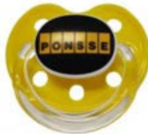
Ponsse Pacifier (Part #: 1546)