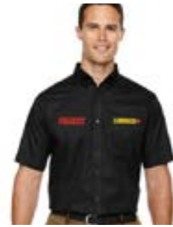
Landrich Short Sleeve