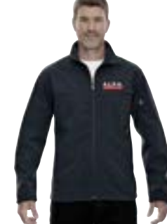
A.L.P.A. Softshell (Part #: ALPA-Softsh-size)