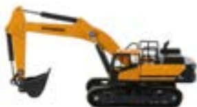
Hyundai HX520 1/87 scale