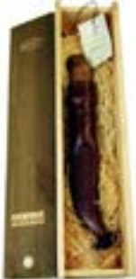
Ponsse Knife (Part #: 914)