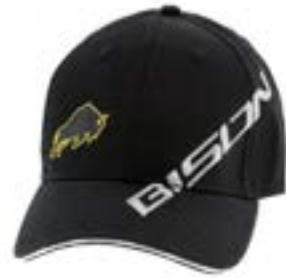
Bison Cap (Part #: 1370cap)