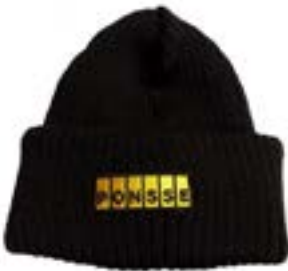
Ponsse Black Wool Tuque (Part #: 1331)