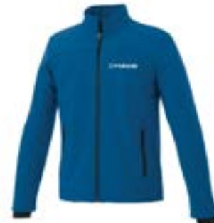
Fuchs Softshell (Part #: Fuchs-S/S-size )