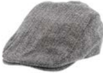
Ponsse Scotch Cap (Part #: 1317)