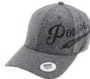
Ponsse Flex Cap (Part #: 1414 sml-med - 1415 lg-xl)