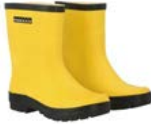
Kids Rubber boots