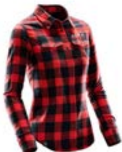
A.L.P.A. Women's Red Plaid Shirt (Part #: FLX-1WRED-size)