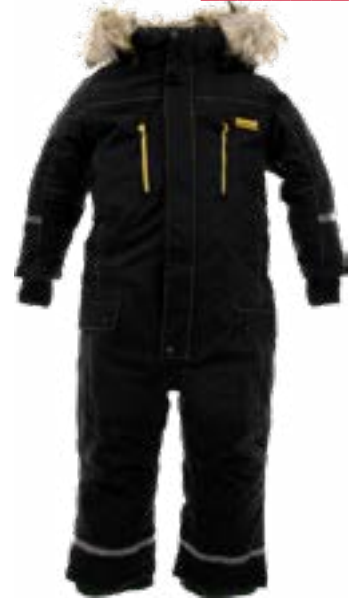
Kids Rubber boots