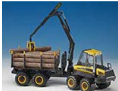
Ponsse Elephant Model