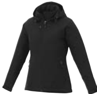
A.L.P.A. Women's Insulated Softshell (Part #: 99531-size)