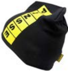
Ponsse SKI CAP (Part #: 1261)