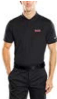
A.L.P.A. Men's Nike Polo (Part #: 88181B-size)