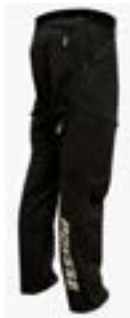
Ponsse Black Trouser (Part #: 1202size or 1389size)