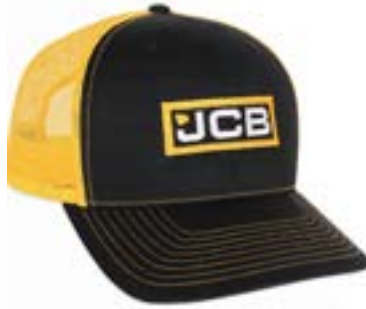
JCB Richardson Trucker Cap (Part #: 31008)