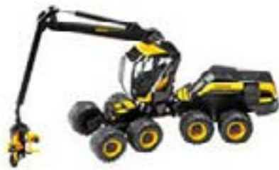
Ponsse Scorpion Model