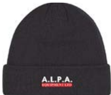
A.L.P.A. Tuque (Part #: Tuque-ALPA)