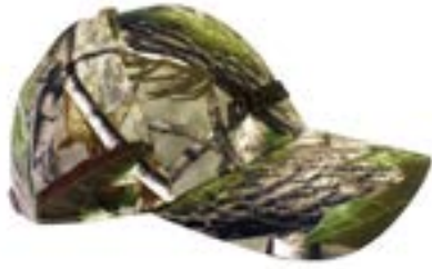
Ponsse Camo Forest (Part #: 1169)