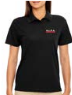
A.L.P.A. Women's Polo (Part #: ALPA-size-Polo-W)