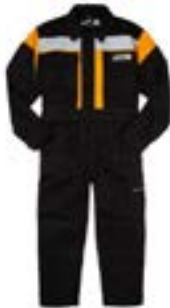
JCB Kid's Overalls (Part #: 81002 BK size)