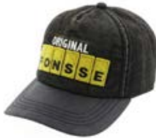
Ponsse Denim Cap (Part #: 1416)