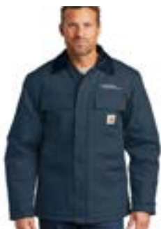
Hyundai Carhartt Coat