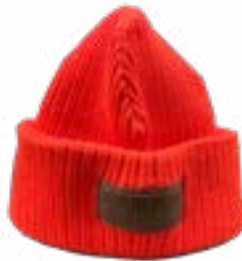
Ponsse Safety Tuque (Part #: 1330)