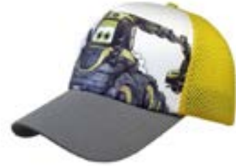
Ponsse Teddy Bear Cap Kids (Part #: 1087)