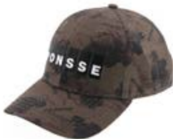
Ponsse Cap (Part #: 1395PO)