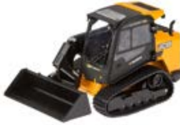
JCB Teleskid Model (Part #: 98012)