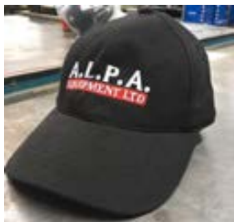
A.L.P.A. Brushed Cotton Cap (Part #: Cap-ALPA-Adult or Child)