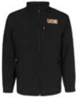
JCB Softshell (Part #: 15002 BK.size)