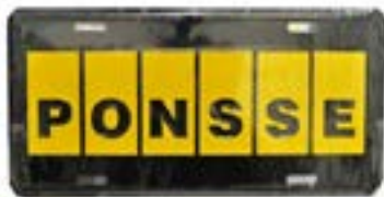
Ponsse License Plate