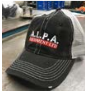
A.L.P.A. Mesh Cap (Part #: Cap-ALPA-SUM-GR)