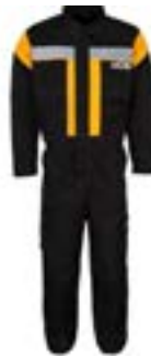
JCB Adult Overalls (Part #: JCB1772 - 16001 BK)