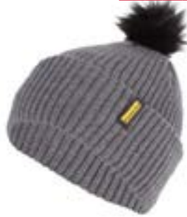
Ponsse merino beanie