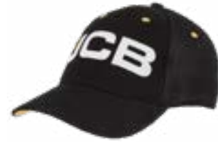
JCB Mesh Cap (Part #: JCB1611)