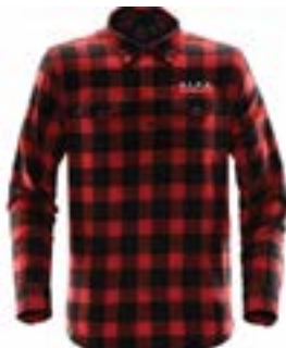
A.L.P.A. Men's Red Plaid Shirt (Part #: FLX-1MRed-size)