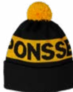
Ponsse Kids Beanie (Part #: 1309)