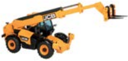
JCB 535-140 Telescopic Model (Part #: 98001)