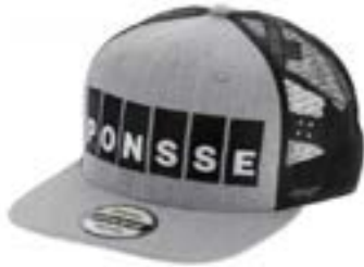
Ponsse JUNIOR CAP