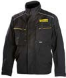
Ponsse Winter Jacket (Part #: 9711size)