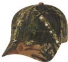
Hyundai Camo Cap