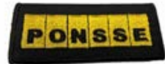
Ponsse Patch (Part #: 1117-PO)