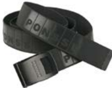
Ponsse Belt (Part #: 1211PO)