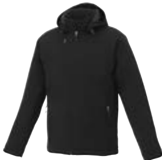
A.L.P.A. Men's Insulated Softshell (Part #: 19531-size)