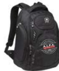
A.L.P.A. OGIO BACKPACK (Part #: 411065)