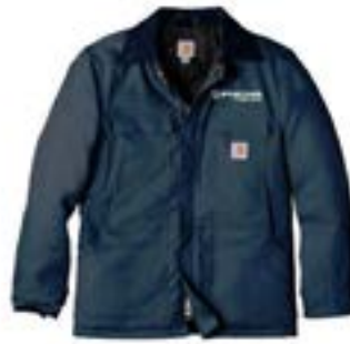
Fuchs Carhartt Jacket (Part #: CTC003-FUCHS-size)