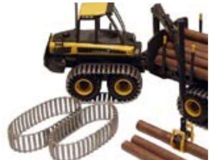
Tracks for Elephant Model