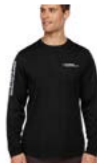
Hyundai Performance Shirt