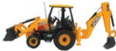
JCB 3CX Model (Part #: 98010)