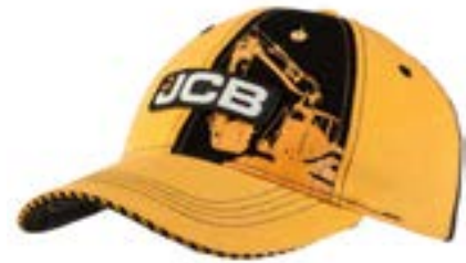
Kid's Black & Yellow Cap (Part #: 81010)