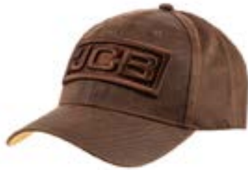
JCB Brown Oiled Cap (Part #: 31002)