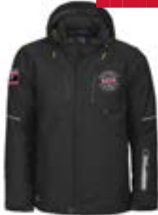
A.L.P.A. 45 th -e Insulated Softshell (Part #: ALPA-WINTER-Jacket-size)